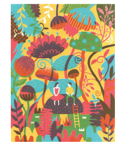
Riso Print, Simple Colored Shapes