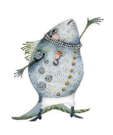
Antique, Detailed, & Vintage