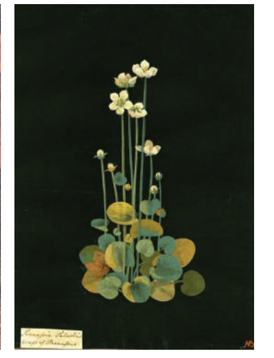
Floral, Dainty, Elaborate